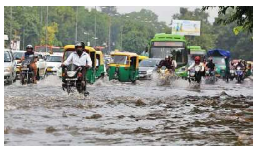
The problem is, Delhi continues to rely on a nearly four-decade-old drainage master plan made in 1976.

http://www.dnaindia.com/india/report-first-drainage-master-plan-in-40-years-ready-2547926